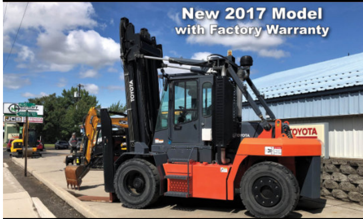
New 2017 Model with Factory Warranty